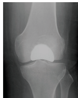
KineMatch Patient-Specific PFR, front view.