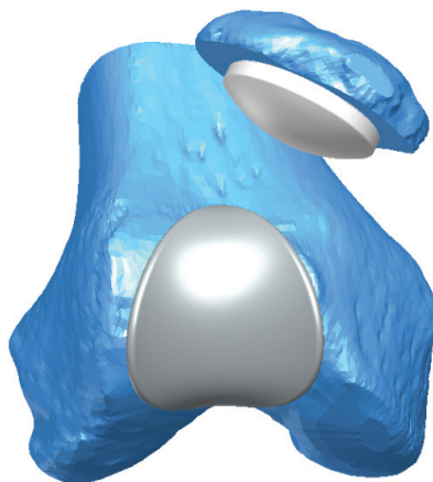
Fig. 1 – A virtual computer model of a patient's knee showing the design for the KineMatch patient-specific implant.

Partial knee replacement with the KineMatch Patient-Specific PFR is covered by most insurance plans.