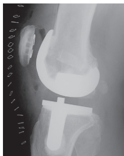
Total knee replacement, side view.