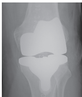
Total knee replacement, front view.