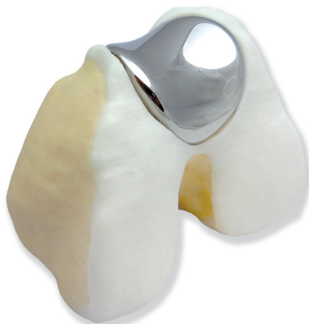
Fig. 2 – An actual patient-specific KineMatch PFR implant on a CT based model of the knee.